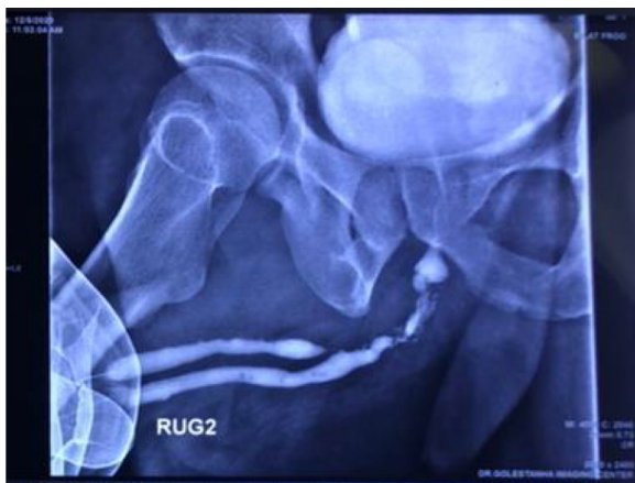
Fig. 1 Patient's RUG before operation, showing stenosis in the proximal region of the bulbar urethra

urethral cystoscopy, the mucosa was relatively pale and the opening of the second urethra was not visible in the penile and bulbar urethra. Stricture and paleness of the mucosa was also seen in the proximal bulbar urethra. On