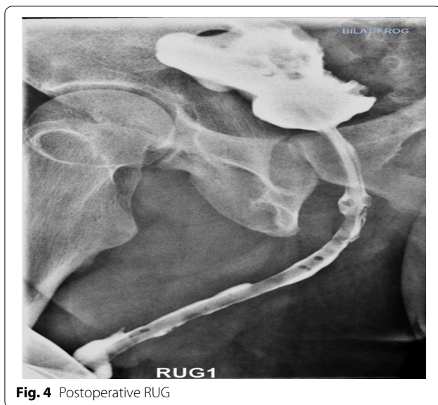
Fig. 4 Postoperative RUG

UTIs over time and was treated for prostatitis and urethra stricture on several visits to doctors. However, none of the treatments solved the patient's problem. Owing to recurrent relapse, urethra cystoscopy and dilatation were performed to relieve urethral stricture, but it still continued after the antibiotics were stopped. Finally, the patient was referred to a subspecialty center, where the diagnosis of urethral duplication was confirmed by performing VCUG and RUG. The most common classification for urethral duplication is the Effman classification, in which urethral duplication is divided into three types [5, 6] (Fig. 3):